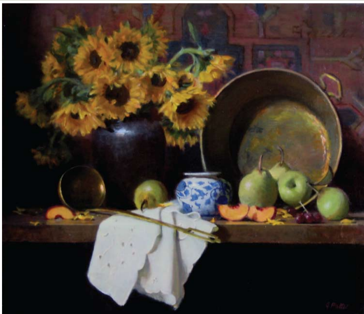
Yalli Pears 25" x 29" Oil