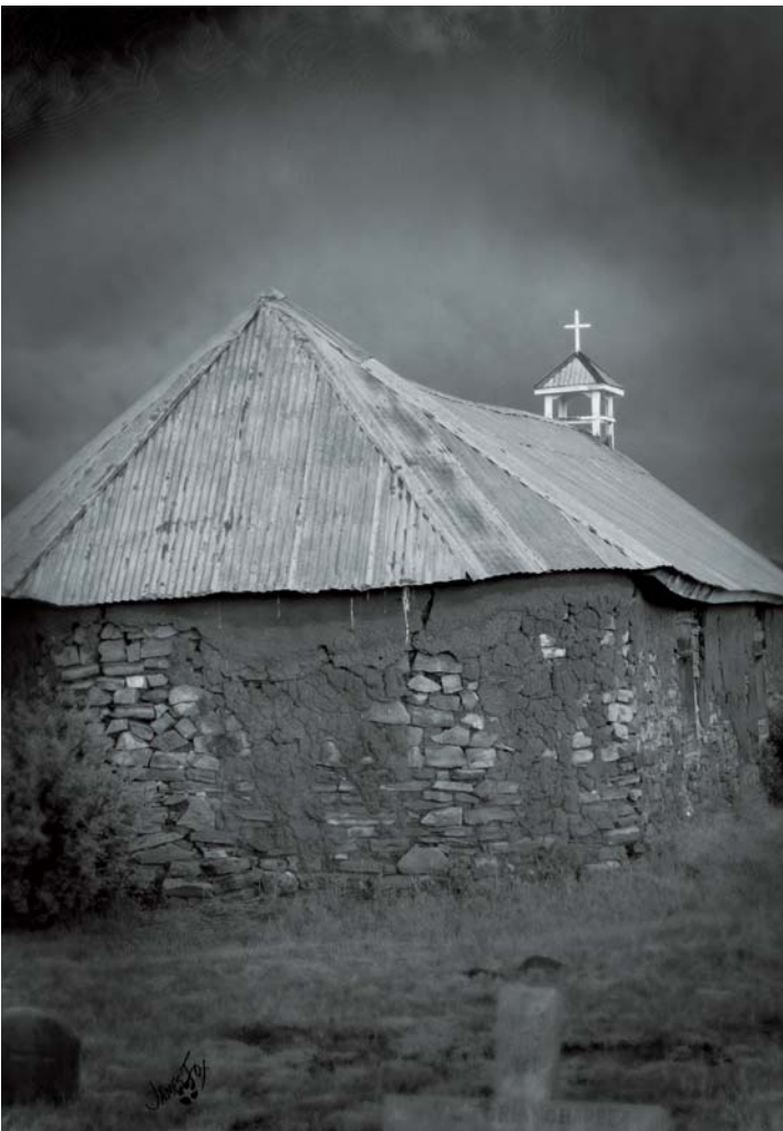
JAMES FOX, SAN ISIDORO, PHOTOGRAPHY, 24 X 18"