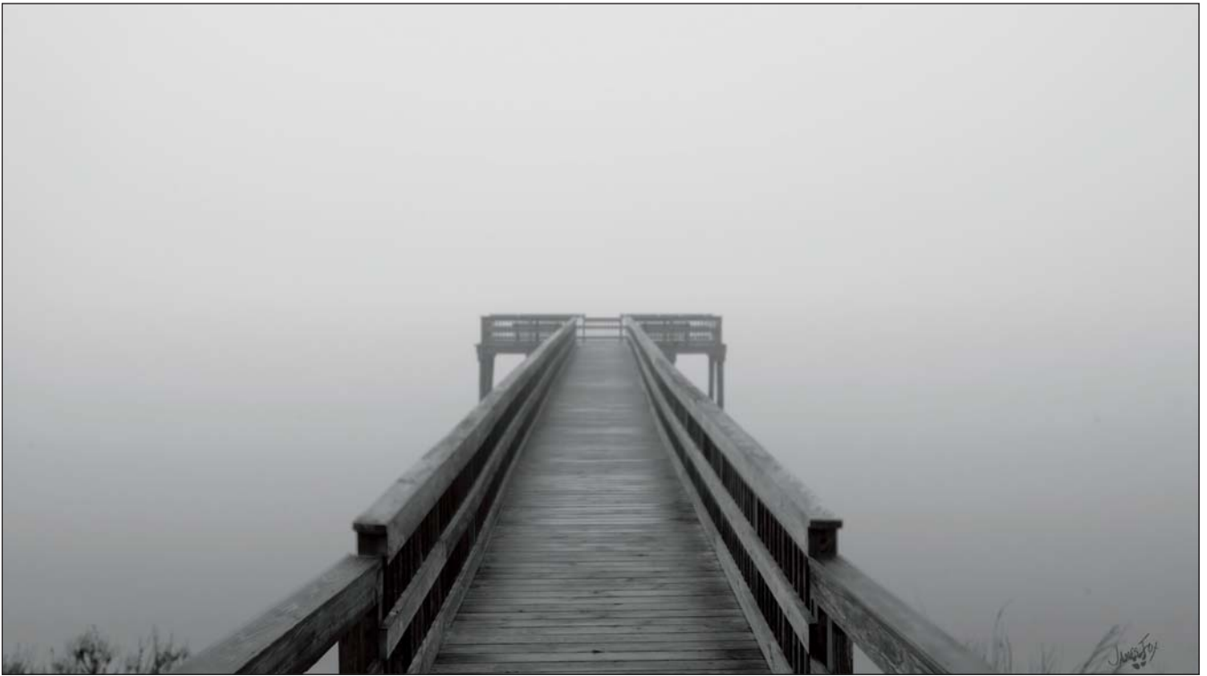
JAMES FOX, PIER IN FOG, PHOTOGRAPHY, 16 X 25"